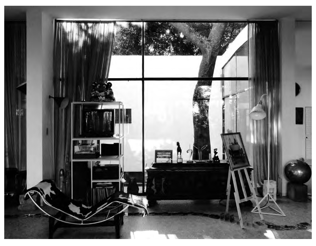
balconies, terraces, windows, and doors as elements that mediate the experiencing of dwelling as an experience in motion.

This concluding section addresses the process of designing as the outcome of an attitude opposite to the desire for totality. Designing interiors for people is the antidote to designing monsters. Designing to allow imperfection is not a weakness. Rather, it is the wise consequence of considering time, atmosphere, memories, intimacy, transformation, ambiguity, fragility, and liquidity when designing a space, especially a domestic one. While it is not the aim of this article to deepen methodologies or techniques to design allowing the inscription of imperfection of daily life, we do seek to remind designers of the non-objectification of spaces to inhabit, and to encourage them to explore parameters like materiality, texture, light, shadow, colour, detail, rhythm, sound, landscape,