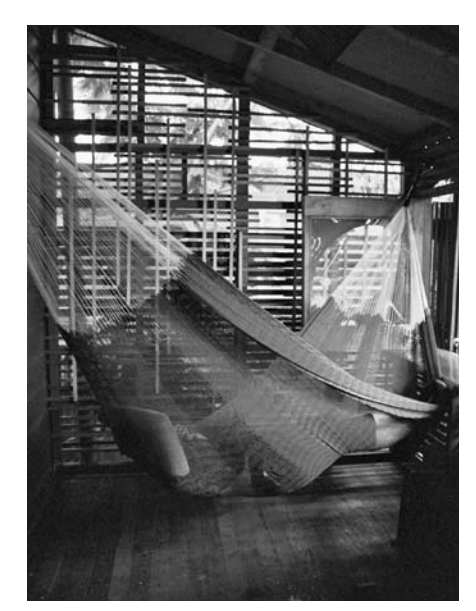
Figure 5: Edge space at Avebury St., 2002.