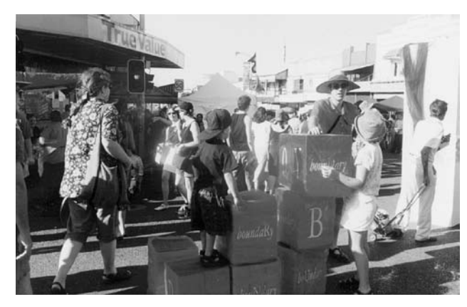
Figure 3: Children interacting with the Behind the Boundary installation at the West End Street Festival, Brisbane, 2000.