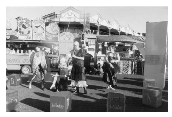
Figure 2: Street performers use box elements from Behind the Boundary installation, West End Street Festival, Brisbane, 2000.