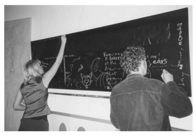
Figure 1: People drawing on blackboard in Respond installation at Architect's Art Exhibition, Brisbane, 1999.