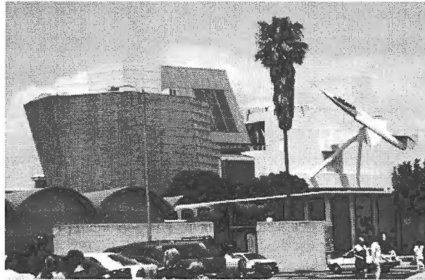
Figure 7: California Aerospace Museum, Frank Gehry, 1982.

(Figure 7), the airplane is literally a sign for the building, but also a marker for the door and entrance. The disruption of the viewer's frame of reference which is brought about by using an airplane as an architectural element could lead the observer to reflect on the nature of architectural and aeronautical elements, the use of signs and symbols, the appropriateness of materials, architectural decorum; it confronts the viewer and asks him or her to think about the relationships between airplanes and architecture, more significantly, architecture and themselves.