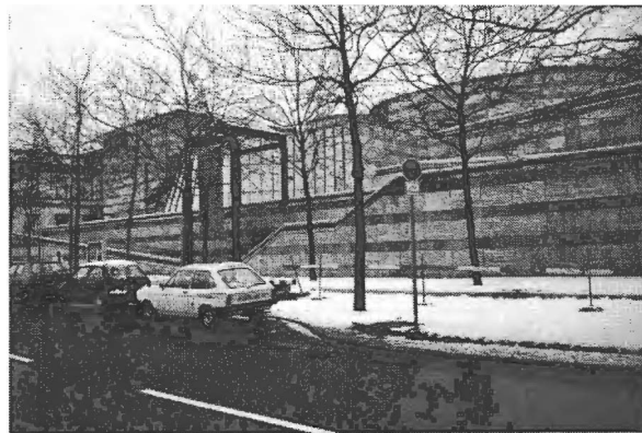
Figure 3: Entrance, Staatsgalerie, James Stirling, 1977.

Architecture capitalises on its relationships with things that are present within the building. Context, history and memory can all serve as referents for the work of architecture. In this sense, buildings are texts which are generated by assembling three-dimensional mosaics of fragments, excerpts, citations, passages and quotations; and every building is an absorption and transformation of other buildings (Frascari, 1985). James Stirling showed the dichotomy in Staatsgalerie in Stuttgart between the formality of museums in the past and the informal approach: representational and abstract, monumental and informal, traditional and high tech. The new additions are treated externally with a grid of stone pilasters used to establish visual order on walls where the random positioning of windows relates to the varied size of rooms. In addition, the handrails of the outdoor ramps have swollen into colorful guides of bright blue and pink which house the lighting system. Like the glazed sweep of the entrance (Figure 3), they undermine the monumental posturing of the stone-clad, U-shaped building with its classicising overtones, and thematise access to the building. The climax of the highly allusive architectural collage is the sunken rotunda in the courtyard (Figure 4), where the U-shaped palazzo building is echoed and placed on a high plinth above the traffic.