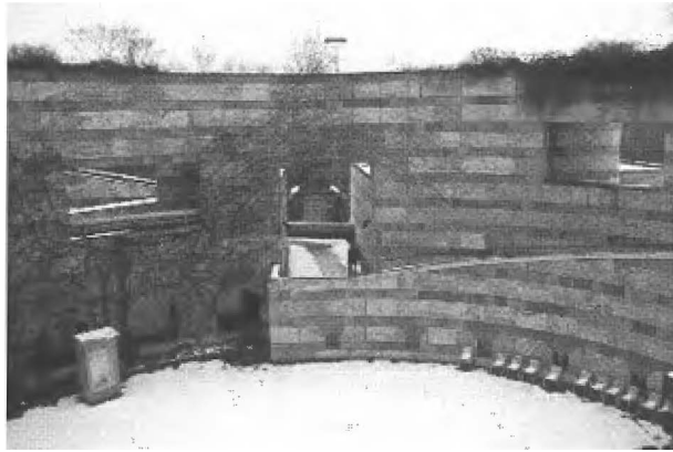
Figure 4: Courtyard, Staatsgalerie, James Stirling, 1977.

Arata Isozaki explored the principles of collage within the practice of architecture. Isozaki freely borrows previously used motifs and reinserts them into his own compositions. In a Surrealistic collage the elements of the Tsukuba Civic Center, some of which have been derived from Ledoux, are reconstituted to make a fragmented heterogeneous assemblage (Drew, 1982). This use of precedent endows his work with a specific cultural meaning, and imparts to that meaning an inertia that permits a universal and enduring perception. The Tsukuba Civic Center explored design as the provision of equipment in the environment for encounters, creating a theater of actions, a foundation upon which narratives may unfold. Isozaki supplied a narrative – a spatial core based on program requirements and the surrounding context. Thus special attention is given to the analysis of desired situations that give rise to encounters, and particular obligations of architectural elements that contribute to those situations, in particular program, boundary, surfaces, and circulation.