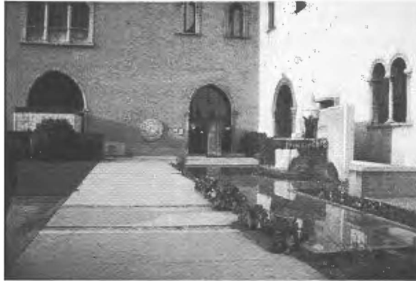
Figure 5: Entrance Courtyard, Castelvecchio, Carlo Scarpa, 1958.

Scarpa's plan is clearly visible to the visitor because it consists substantially of a circuit which starts from the entrance gate after the castle's drawbridge and develops in straightforward fashion, providing the visitor with opportunities to emerge into the open and then re-enter on the tour of inspection (Licisco, 1982, p. 79).