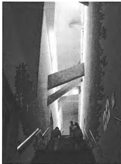
Figure 2: Interior View, Jewish Museum, Daniel Libeskind, 1992.