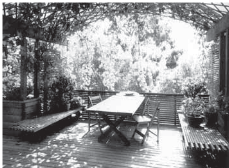
Figure 10: Stout/Mitchell house (1995). (Photography: Mitchell Stout Architects)

Research also confirmed that providing both thermal comfort and UVR protection is complex. In central New Zealand, the ultraviolet index (UVI) is over 2 for eight hours a day in summer, but 69% of the time the air temperature cooled by sea breezes is too cool for comfort. (Mackay, 2003). In these conditions laminated glass and polycarbonate provide excellent UV protection while transmitting the warmth of the sun.