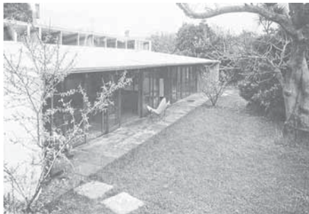
Figure 6: Narrow 'verandah' to the Malitte House (1954).

pitched shed-like forms with 'cut-out' patios and porches. At 1.8 metres deep, the outdoor living space of the verandah of Brown's own house in Arney Road , Auckland (built in 1939) was little different to the Villa Savoye verandah discussed at the beginning of this paper (Shaw, 2003, p. 146). However there were distinctions: the up-tilting roof and large areas of glass permitted much more light to the interior, and the living area opened to the verandah with glazed doors. The verandahs of the firm, Group Architects , who took the barn and the whare rather than the Villa Savoye as their starting point, were of similar proportions. Their Second House (1950), nick-named the Pakeha House , placed a verandah along the gable end of its whare -like form. However, the proportions of their mahau fail to shelter and accommodate a social group as successfully as its cited precedent. In the Malitte House (1954), the Group Architect Bill Wilson introduced clerestory windows to admit sunlight to the interior of the deep floor plan (Chaplin & Mitchell, 1984, p. 35) with the verandah roof remaining at a width of 1.8 metres. This reinforced the shed reference and produced a definite boundary to the garden. The verandah shaded the full-height glazing and sheltered the doorways, but did not invite use..