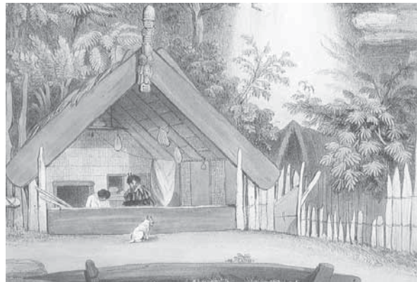
Figure 1: A lithograph of a mahau by J.W.Giles (1822–86).

The Maori, who migrated to New Zealand around 800 AD, were accustomed to the very high ultraviolet levels encountered near the equator and therefore, their skin offered good protection for the lower levels experienced at more southern latitudes. The principal family dwelling of the Maori was the whare , a low single roomed gabled structure of wood and thatch. It is an example of an adaptation to climate. The dark interior, illuminated by a single window opening, opens to a mahau , a deep porch at the gable end. This is accessed via a sliding door. The whare opens to the east to welcome the sun, but this orientation is also pragmatic as it allows the morning sun to warm the earth floor of the mahau and give comfort for the remainder of the day. Cooking is done in the open or, during wet weather, in a lean-to made of manuka frames thatched with raupo . Food was never consumed inside any whare , but in wet weather it could be taken in the porch (Shaw, 2003, p13). The mahau , therefore, is a practical day-time living space, sheltered from the wind and rain, and open to the daylight.