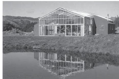
Figure 7: Nigel Cook The Kelly House (1988).

These simple building forms became passé in the late 1960s, when young New Zealand architects, Ian Athfield (Melling, 1980) and Roger Walker (Melling, 1985) rejected the intellectual constraints of modernism to freely create intimate and romantic environments. They looked nostalgically to the nineteenth century colonial past for inspiration and decoration. French doors opened once again to narrow cottage verandahs complete with pastiche cross-bracing on balustrades. Although the form remained, the roofing material often became glass, transmitting light and heat to both the adjacent interior and the verandah itself. Transparent shading materials suited the New Zealand climate. Over the next decades, roof glazing and conservatories became a common feature of local architecture.