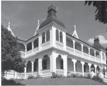
Figure 2: Elaborate verandahs of Alberton (1870).

Alberton, a house located on the slopes of Mount Albert, Auckland, was initially built as a two-storied gabled farm-house in 1862. Then, in 1870 the architect Matthew Henderson added elaborate verandahs which wrapped around three sides (Shaw, 2003, p. 41). These copious verandahs were to reflect status rather than provide amenity.