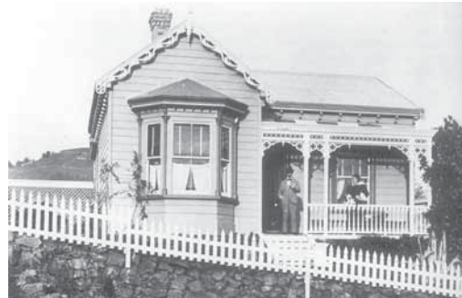
Figure 3: The verandah of this house in Mt Eden, Auckland, c 1895 addresses the street.

The design of the verandahs of Victorian villas were based on United States west coast precedents – standard plans which included narrow six foot wide verandahs with a variety of highly decorated extras (Toomath, 1996, p. 133). Irrespective of the sun, the verandah faced the street. Along with lace curtains, timber blinds and copious drapery, the verandah became another layer to ensure privacy of family life. The resulting shady interior was welcomed, as exposure to sunlight was considered unhealthy and tanned skin regarded as a branding of the lower working class.